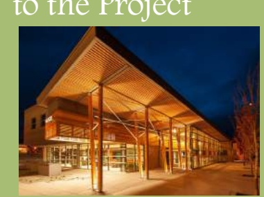
to the Project