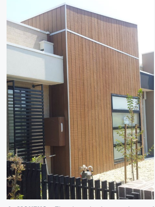
4 MONTHS: The board shows signs of