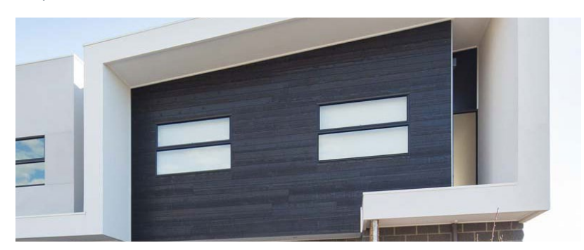
Stained with colour Black Japan

We don't recommend a clear sealant, instead we recommend Cabots Aquadeck or Intergrain Enviropro on the Weathertex Natural range. Please make sure to follow all product instructions when staining as they may vary.