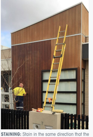
boards run - vertical for vertical cladding