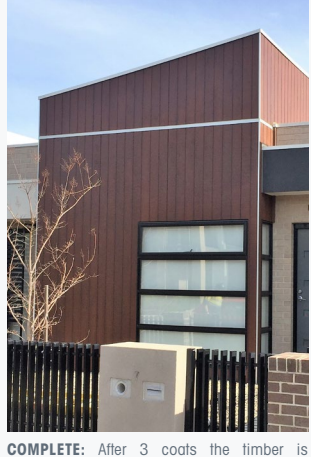
restored and is now UV protected