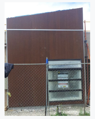
0 MONTHS: Recenlty built, this shows the beginning colour of Weathertex Natural